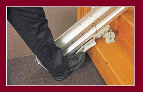
Simple to use foot lock makes folding and unfolding the rail easy and safe