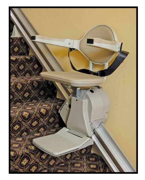
The hidden, rack-and-pinion drive system provides a smooth ride, without hesitation, when the unit stops and starts.