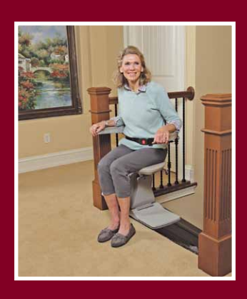
The convenient offset swivel seat mechanism provides a safe, comfortable exit at the top of the rail.