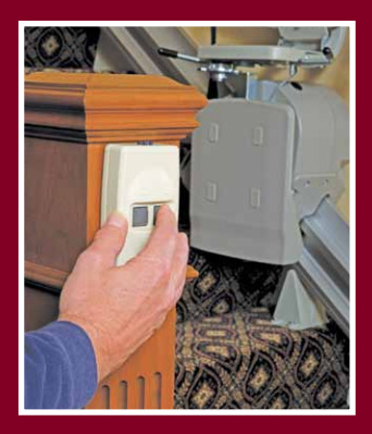
The two wireless call/send controls make installation simple and clean with no wires running along the wall.