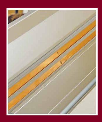
Continuous charge strips along the entire rail, mean the unit will be charged wherever it stops on the staircase.