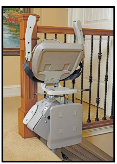
The arms, seat and footrest flip up, creating plenty of space to walk up the stairs.