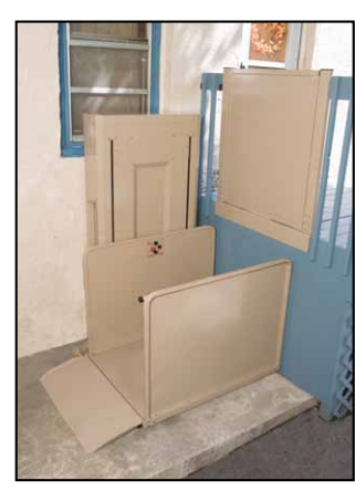
VERTICAL PLATFORM LIFT