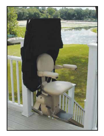
OUTDOOR ELECTRA-RIDE™ ELITE The only 400 lb/181.8 kg capacity outdoor