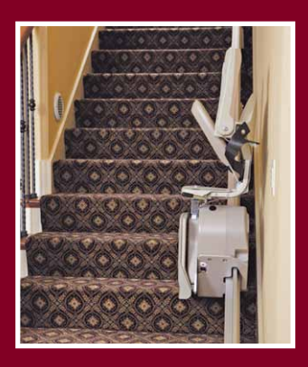
The vertical straight rail can be installed to within 5" of the wall, and when the armrests, seat and footrest are folded, the Elan carriage takes up only 12".