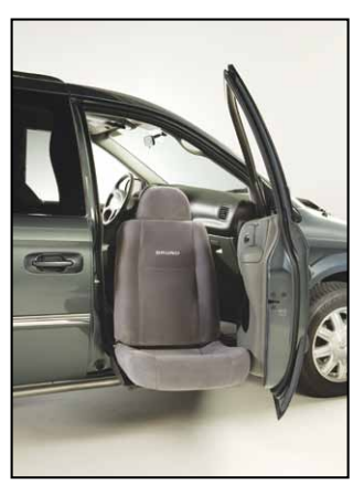
VALET SIGNATURE SEATING

Founded over 25 years ago, Bruno Independent Living Aids, Inc., is a world-wide manufacturer of accessibility products designed to enhance the lives of those challenged by limited mobility. In pursuing this goal, Bruno is proud to be the only U.S. manufacturer of indoor/outdoor stairlifts, interior/exterior scooter, powerchair and wheelchair vehicle lifts and vehicle seating products to be ISO 9001 Certified. This is one of the most stringent, widely-recognized quality standards in the world and your assurance that Bruno is committed to providing you with the highest-quality, most reliable products in the industry. Ask your certified Bruno dealer for details on all Bruno independence products.