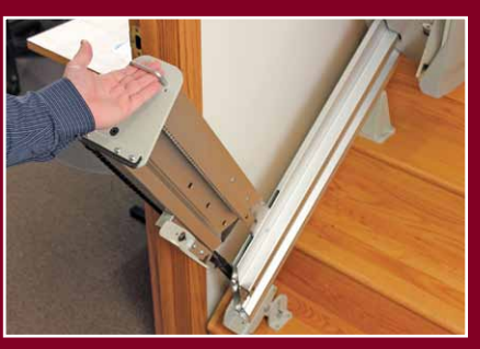
Handle makes Folding Rail easy to move up or down